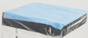
Mayo Band™ Sterile Bags #925.MBSB